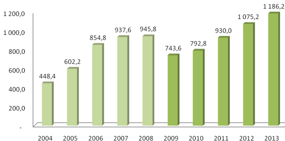
FIGURE 3 CZECH REPUBLIC: Motor Vehicle Production 2004 – 2013 (in Thousand Pieces)

Source: Data for 2004 to 2008 are actual consumption data from ACEA & AIA CR; data for 2009, 2010 & 2012 are CSM Worldwide forecasts; data for 2011 and 2013 are MARKETiN forecasts.